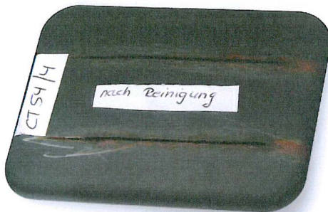
Cleaned test plate after 10.000 hours